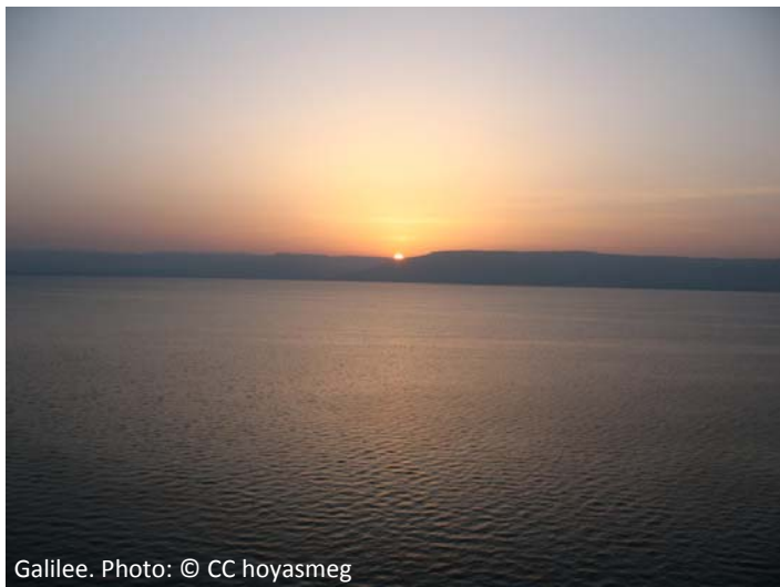
Galilee.

vite a secular Jewish friend who passionately affirms the Jewish State. In Bethlehem, I choose a Palestinian Christian friend who speaks movingly of how his countrymen contributed to the building of the Wall that so harmed their own economy. Both are listened to, and both are loved - and their hearers develop "ears to hear".