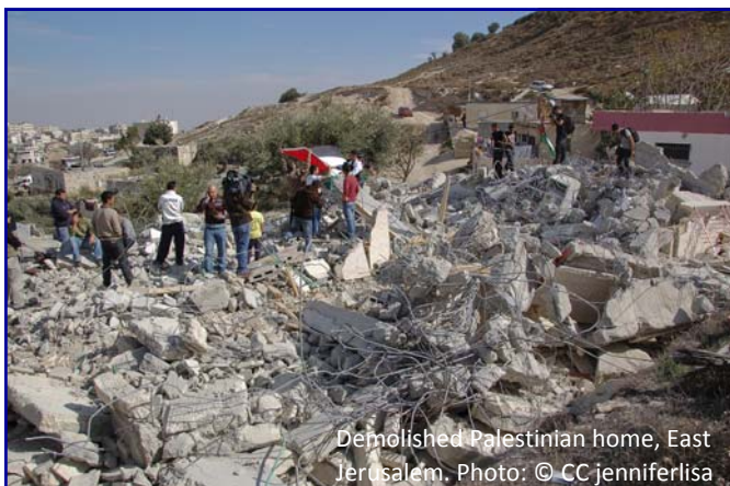
Demolished Palestinian home, East Jerusalem.

What does God say, for people living in Gaza today, blockaded and trapped, when a UN investigation declares that during Operation Cast Lead war crimes were committed by both sides—and particularly levels strong criticism at the Israeli army after 1,400 people were killed and 3,500 injured— and is ignored?